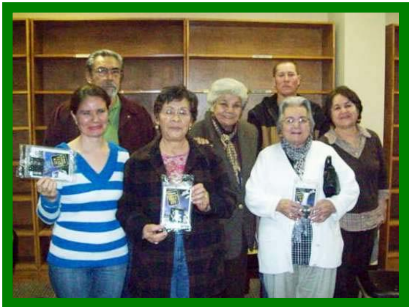
Participants at the April Project IDEAL meeting were proud to receive radon kits to test their homes.