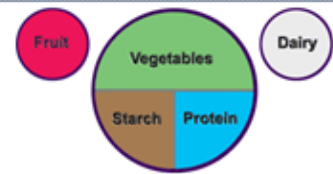
Idaho Plate Method