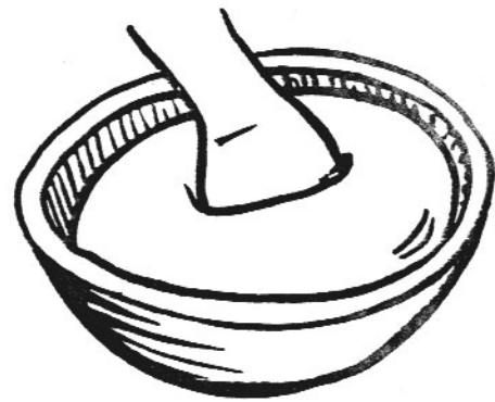
2. Punching Down