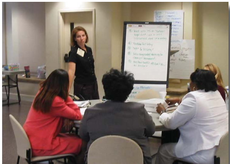
Fort Valley meeting

The City of Ft. Valley applied for CHIP funding to rehabilitate eight housing units and reconstruct two; FVSU Public Service Center applied for the 2005 HUD Historical Black Colleges & Universities grant to improve the housing in the area surrounding the university. The local housing authority has indicated their intention to apply for the Rural Rental Housing Development Fund program when the RFQ is issued in 2006.