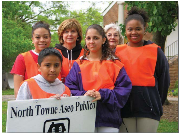
April 2005 KAB North Towne Pride Neighborhood Clean-Up Volunteers

The Cartersville team is working on a revitalization plan that will include a number of new local government programs and policies, directed toward neighborhood revitalization and affordable housing. Among the policies likely to be adopted are waving certain permit fees for infill construction and rehabilitation. The Coosa Valley RDC completed a housing inventory focused on the North Towne neighborhood.