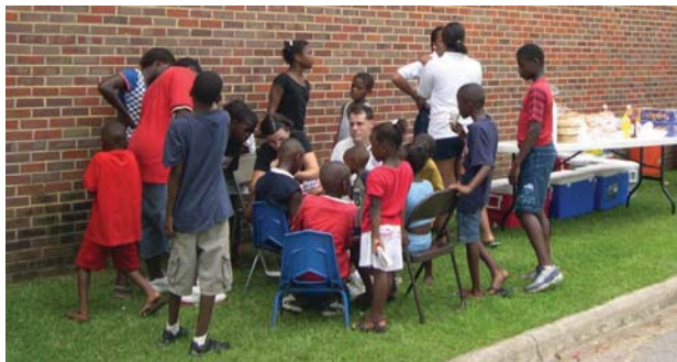
Thomasville Community Fair in NIP

In terms of community outreach, the third focus of the team, activities have included: