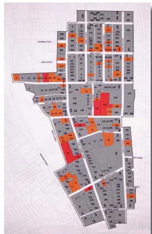
North Towne Area Property Conditions

The Cartersville team is working on a revitalization plan that will include a number of new local government programs and policies, directed toward neighborhood revitalization and affordable housing. Among the policies likely to be adopted are waving certain permit fees for infill construction and rehabilitation. The Coosa Valley RDC completed a housing inventory focused on the North Towne neighborhood.