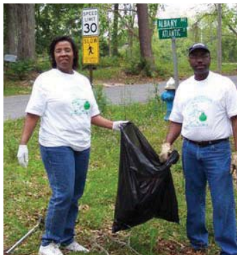
Great Sylvester Clean-up

CDBG funds to help redevelop West Sylvester (phase II of a previously funded CDBG project of street and drainage improvements).