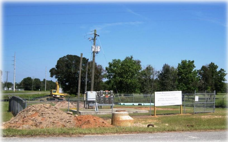
Force Main Replacement