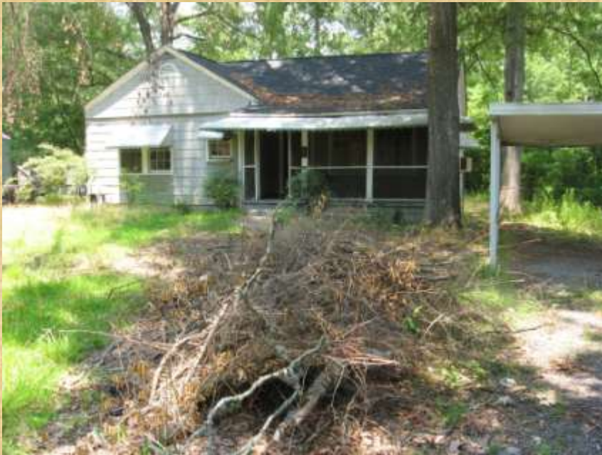
204 Brookwood Avenue Before