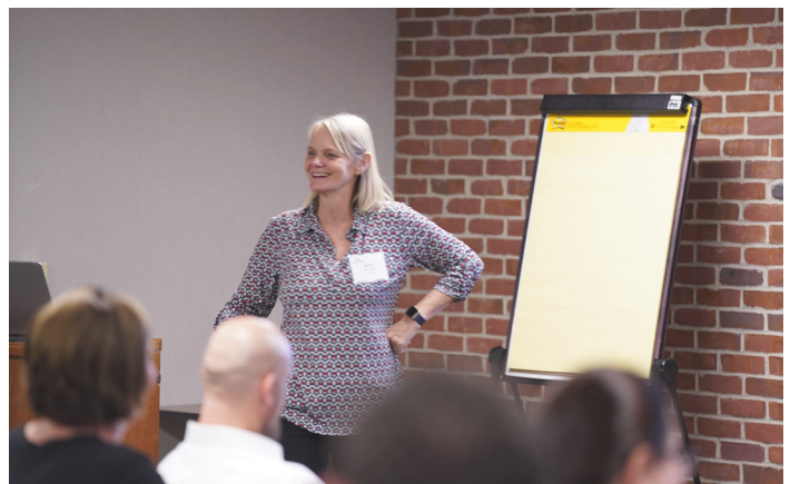
Sessions from the February 2020 retreat in Tifton