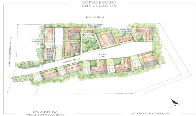
Rendering of the North Canton Village Project

City of Canton: The City of Canton's GICH housing team made remarkable progress during their inaugural year in the program. Setting ambitious goals for the forthcoming three years, they aim to establish a local land bank authority, devise an education and outreach plan, enact ordinances for accessory development units, and finalize the City's down payment assistance program for prospective homebuyers. To achieve these objectives, the Canton housing team established three subcommittees focusing on education and engagement, neighborhood revitalization, and resource allocation.