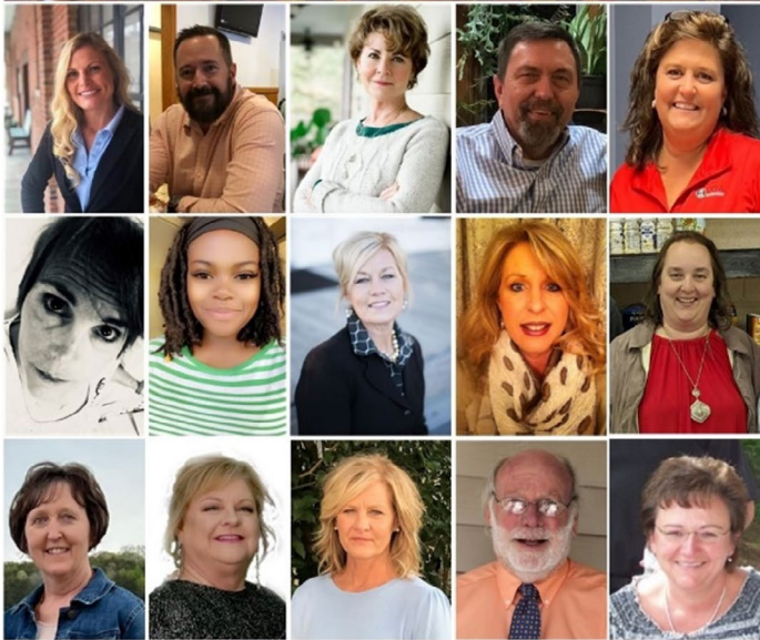
City of Canton GICH housing team members

Moreover, the team forged a crucial partnership with their area's Habitat for Humanity. They also made significant progress toward their goal of increasing missing middle housing by creating a subdivision/commercial property ordinance and securing a grant to fund infrastructure improvements in the area. Furthermore, the team has diligently crafted criteria to guide their decision-making process in awarding support letters for LIHTC developers.