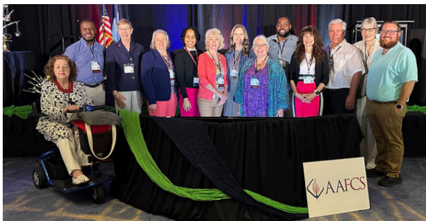
Georgia Delegation after the Opening Session